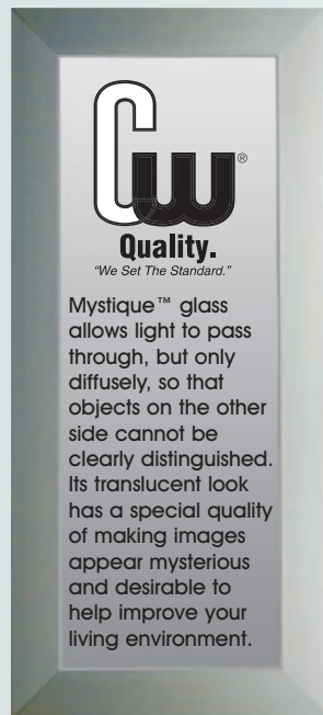
Satin Clear with Mystique™ Glass